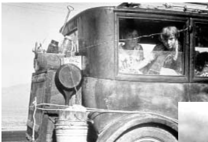
"Okies" going to California